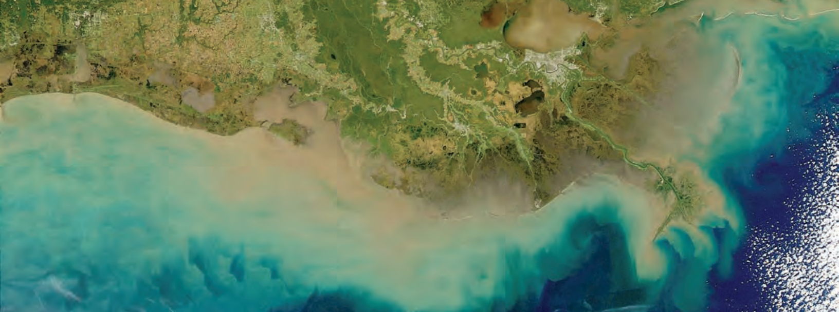
Louisiana coast with suspended sediments and organic matter flowing out of the Mississippi and other regional river systems into the Gulf of Mexico (MODIS Aqua satellite image, November 19, 2003,)