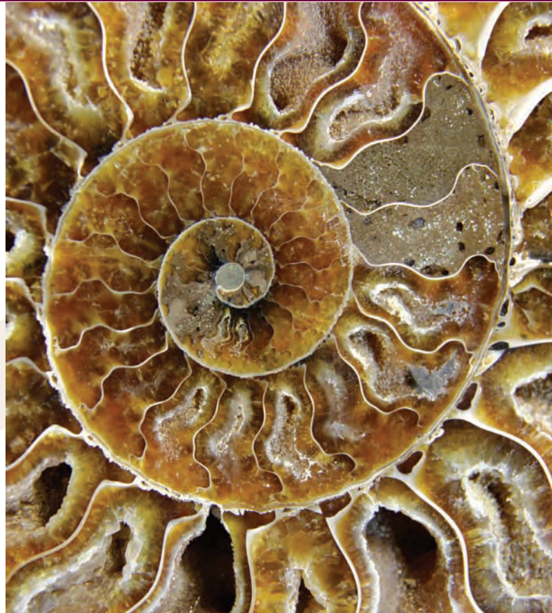
A fossil of an ammonite, an extinct ocean-living mollusk related to the modern nautilus. Ammonites evolved about 400 million years ago and were plentiful in the ocean until the occurrence of a global mass extinction > 65 million years ago that correlates with an asteroid impact.

6.7 The particular life forms that exist today, including humans, are a unique result of the history of Earth's systems. Had this history been even slightly different, modern life forms might be entirely different and humans might never have evolved.