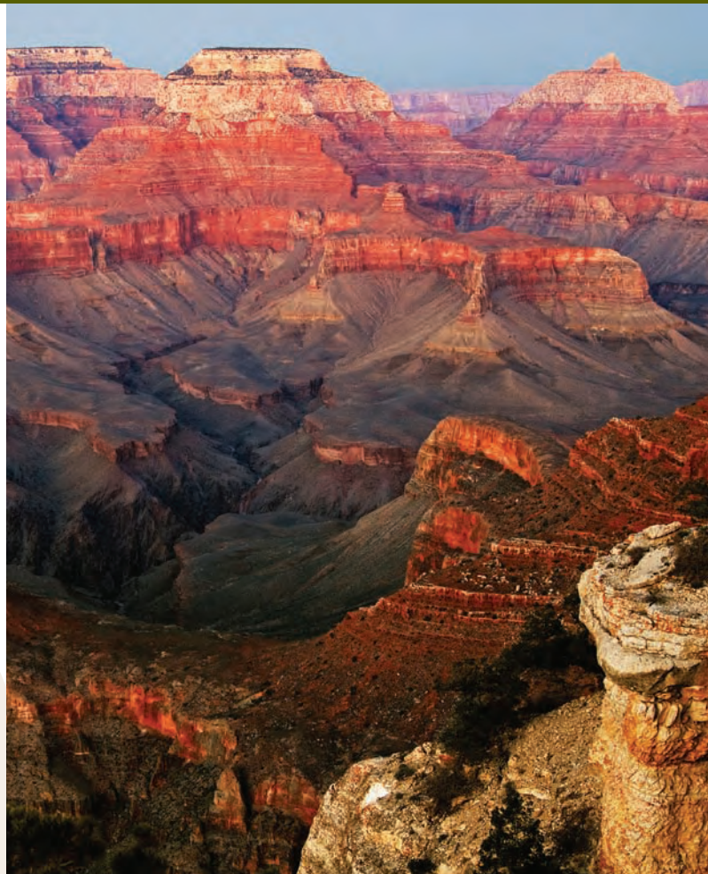
The Grand Canyon represents one of the most awe-inspiring landscapes in the United States. At the deepest parts of the canyon, nearly two-billion-year-old metamorphic rock is exposed. The Colorado River has cut through layers of colorful sedimentary rock as the Colorado Plateau has uplifted.

2.5 Studying other objects in the solar system helps us learn Earth's history. Active geologic processes such as plate tectonics and erosion have destroyed or altered most of Earth's early rock record. Many aspects of Earth's early history are revealed by objects in the solar system that have not changed as much as Earth has.