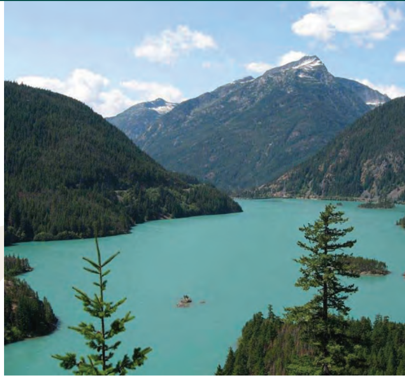
Suspended clay particles, eroded from the Cascade Mountains of Washington State, give Lake Diablo its brilliant color. The active volcanoes of the Cascades result from the subduction of the Juan de Fuca plate beneath North America.

4.6 Earth materials take many different forms as they cycle through the geosphere. Rocks form from the cooling of magma, the accumulation and consolidation of sediments, and the alteration of older rocks by heat, pressure, and fluids. These three processes form igneous, sedimentary, and metamorphic rocks.